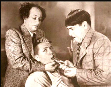
Demonstrating the usefulness of a good pair of pliers

8:30–10:00 p.m. Table sales and tool talking